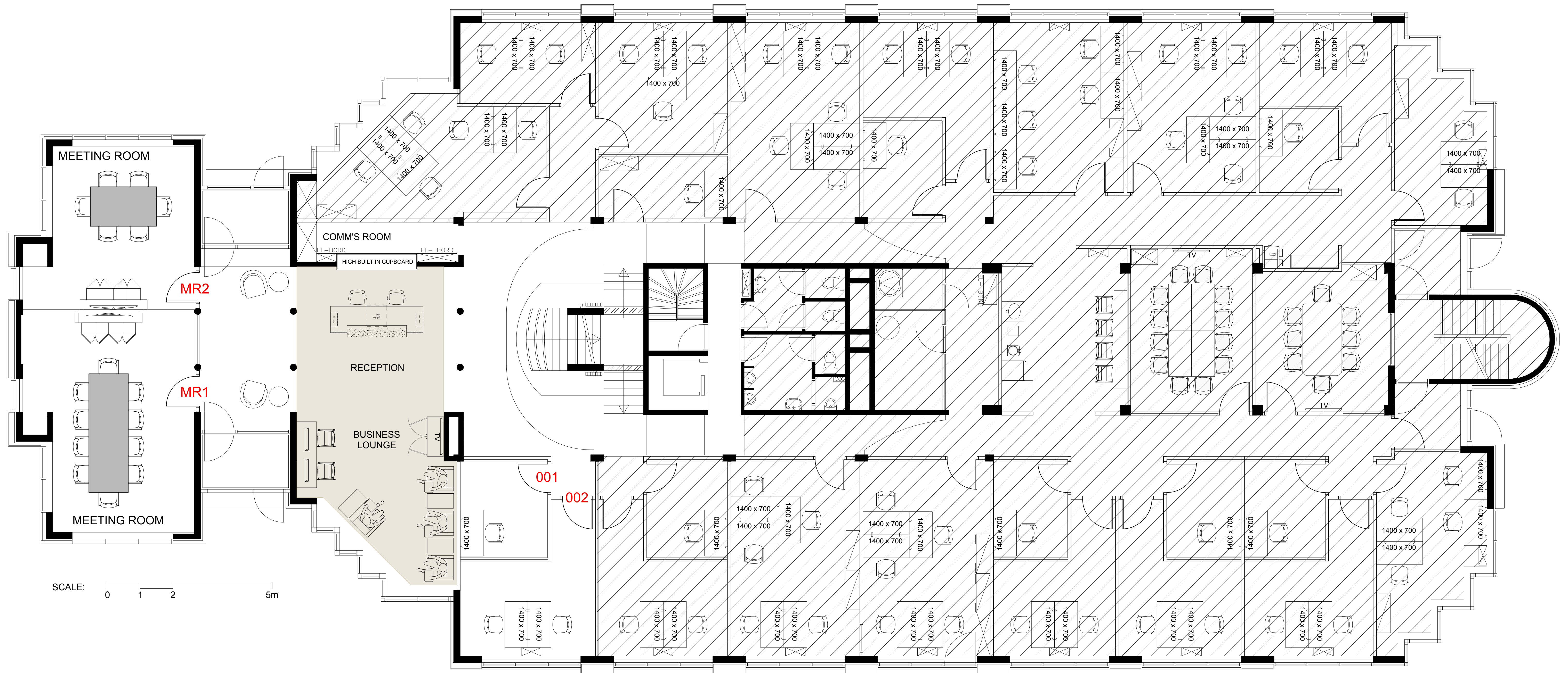
GF LEVEL FLOOR PLAN